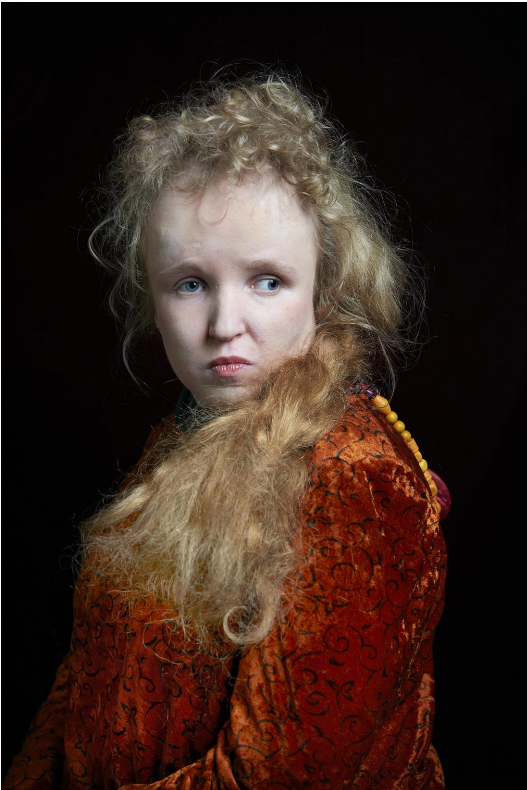
Anastasia, 2011, Pekka Eloma & The Lyhty Workshop

European Outsider Art Association International Conference 2017 Outsider Art Photography